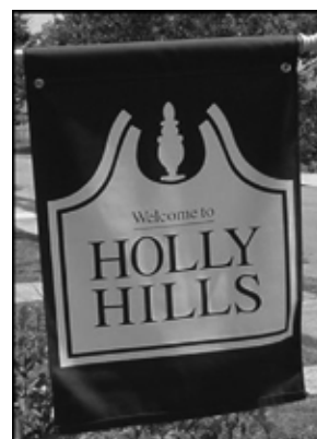
Holly Hills Flag $30

Please mail this form with a check made out to HHIA to: PO Box 22144 | St. Louis, MO 63116