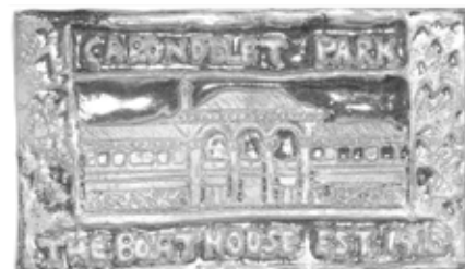
Boathouse Tile $25