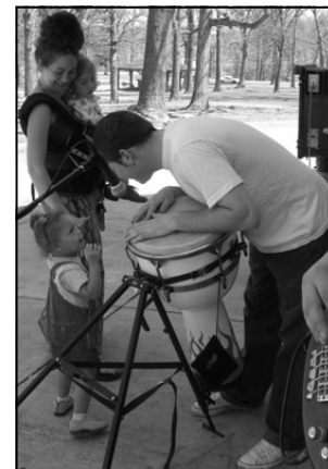
Fun for all ages!

The event will include a recycling fair that will include booths displaying recycling information and resources. Organizations slated to attend include: