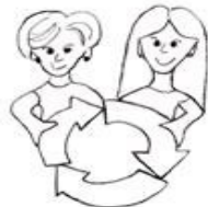
The Green Girls

The plastic pot recycling program at Missouri Botanical Garden has expanded for the 2008 season. From May 1 through October 31, you can recycle your plastic plant pots at the Monsanto Center of the Missouri Botanical Garden, 4500 Shaw Blvd. at Vandeventer, from 9 a.m. to 4 p.m. daily (not open during special event weekends: Aug. 30, 31