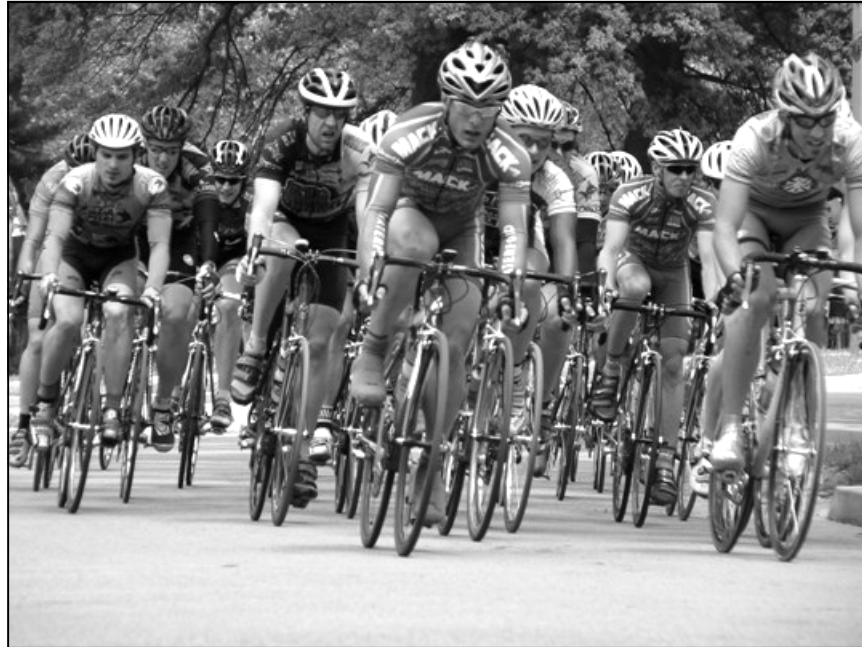
Every Tuesday during the summer, high caliber bike racing comes to Carondelet Park. Racers can reach speeds of up to 30 miles per hour.

Airport, and continued there until the early '90s. Over the next several years the races took place at Gateway International Raceway. Then about eight years ago, with the support of the city of St. Louis Board of Aldermen, the series was moved to