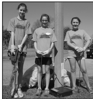
2007 Clean-up volunteers proudly display their finds.

The Holly Hills Improvement Association and Friends of Carondelet Park are sponsoring the second annual Celebrate Carondelet Park Day! on Saturday, April 19. It promises to be an action-packed and fun-filled day starting with a park clean-up from 9 a.m. to 11 a.m. followed by a festival and recycling fair from 11 a.m. to 4 p.m.